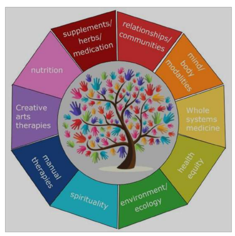
Figure 1. The Benioff Children's Hospital Oakland Integrative Medicine Staff Committee's "Collaborative Medicine Wheel" (a work in progress)

"By its simple shape, circle includes everyone without distinction, welcomes and invites all to participate, and creates equality among those gathered...If you want to include diverse colleagues and think well together, use the circle." (Baldwin & Linnea, 2010).